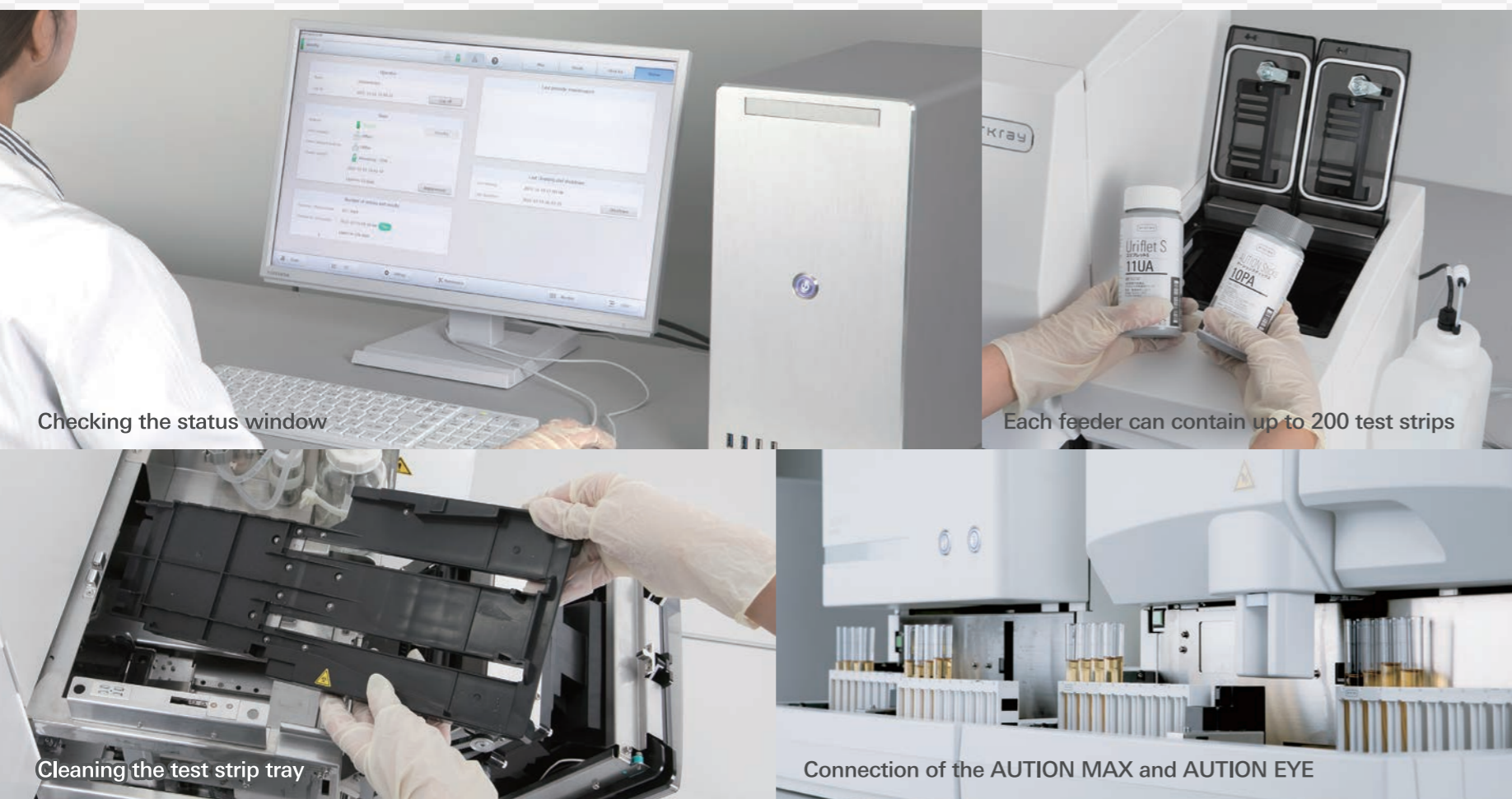
Checking the status window