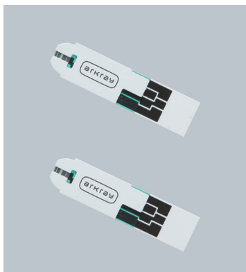
Test strip for GLUCOCARD S