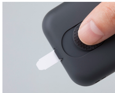
Test strip disposal lever