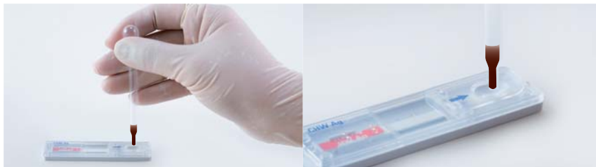
Drop a sample (2 drops) with pipette included.