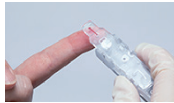
Required sample volume is only 1.5 \mu L.