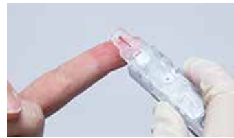
Required sample volume is only 1.5 \mu L.