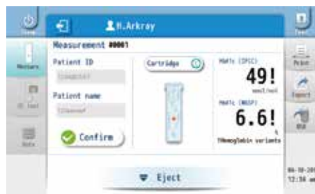
Result display screen (example)